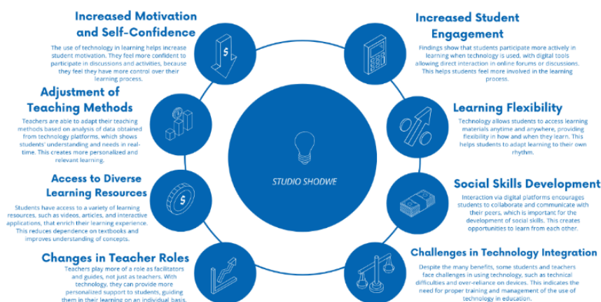
Figure 3. Integration of Technology and Humanistic Approach

Based on the interview results above, it can be concluded that technology integration in education must be done with a humanistic approach to creating a better learning experience. All parties, including teachers, students, and parents, will benefit when technology supports interaction, communication, and collaboration. This underlines the importance of educators focusing on technology as a tool and considering the human aspect in every learning process. Thus, combining technology with human values will produce a more inclusive learning environment that responds to students' needs.